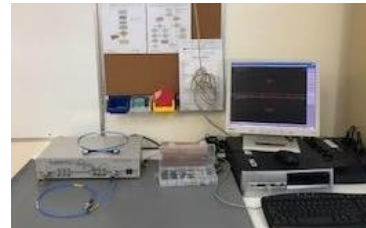
RF Testing Station