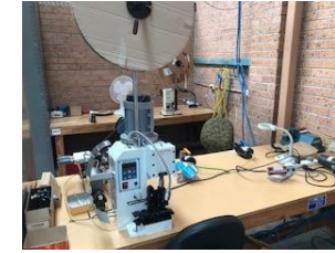
General Air Crimp Area