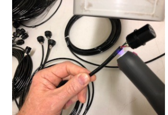
Plasma Treatment Station