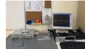
RF Testing Station