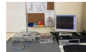
RF Testing Station